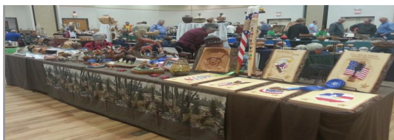
2013 Rhapsody in Wood Show in Grapevine