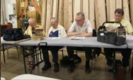
Members at the May Meeting

“TO PROMOTE, PRESERVE, AND PERPETUATE THE ART OF CARVING”